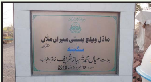
Building Better - A Model Village Inaugurated