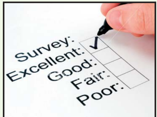
Damage Assessment Survey: A base for reconstruction