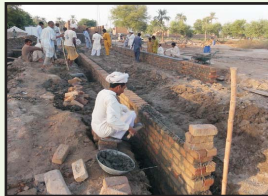
Local community involved in re-construction efforts