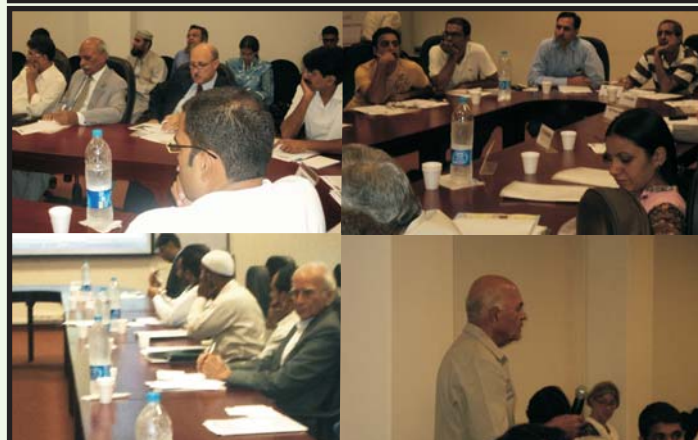
Participants of the session involved in the discussion

The Urban Unit Publications are research based communication tools for providing informed policy options. The contents may not necessarily reflect the Government of Punjab's current official policy.